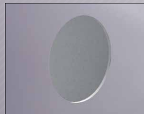
One hole to cut.