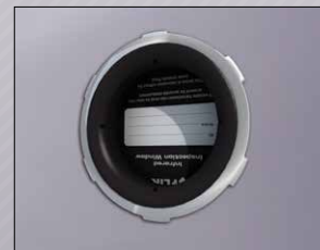
Single PIRma-Lock™ ring nut.